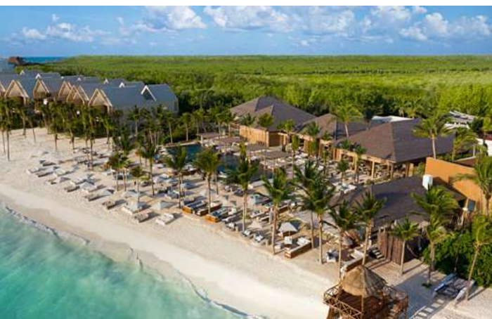
Banyan Tree Mayakoba, Mexico