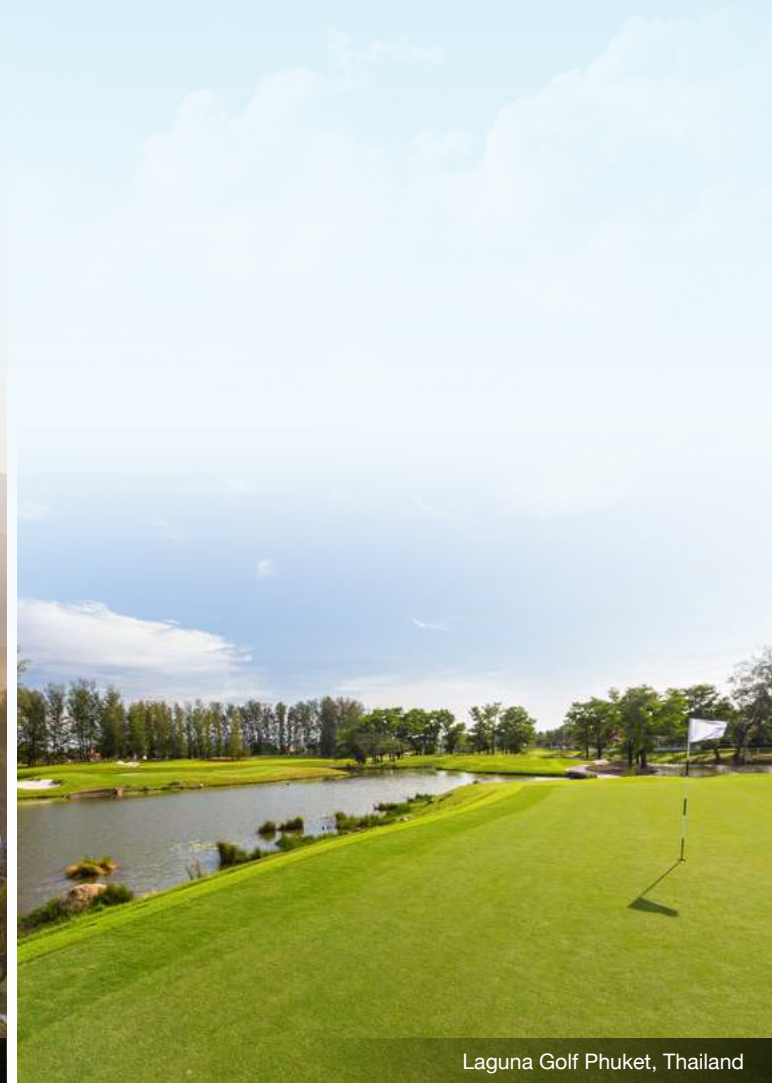
Laguna Golf Phuket, Thailand