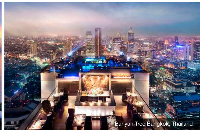
Banyan Tree Bangkok, Thailand