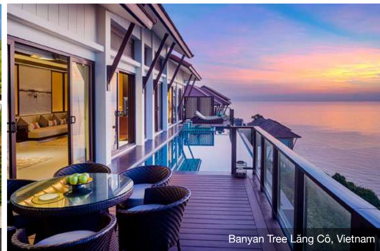
Banyan Tree Lăng Cô, Vietnam