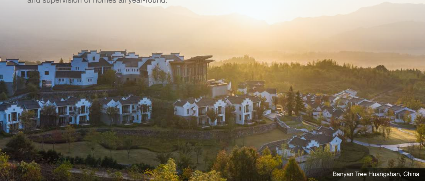
Banyan Tree Huangshan, China

Our Group prides itself on the dedicated management of its properties, along with a generous array of services and amenities committed to nothing short of excellence. A 24-hour concierge is readily available to homeowners, and a professional team will always be on hand to assist in maintenance and rental services. Ensuring top-tier administration and supervision of homes all year-round.